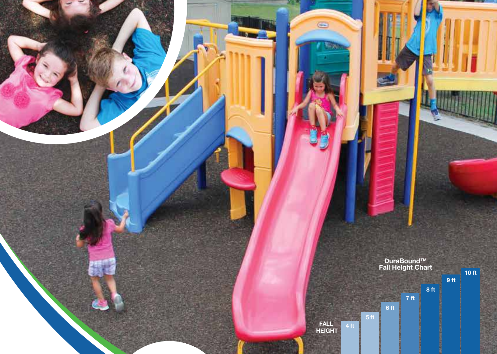
DuraBound™ Fall Height Chart