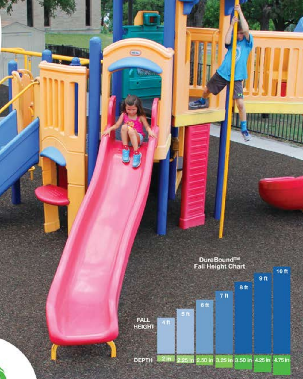
DuraBound™ Fall Height Chart